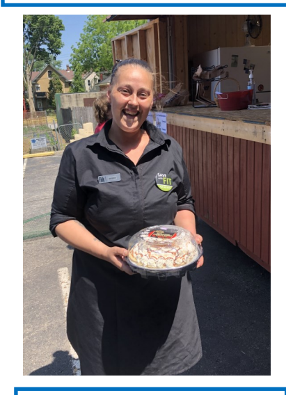
This place is God sent to be pure facts. When you need help they are there to help.