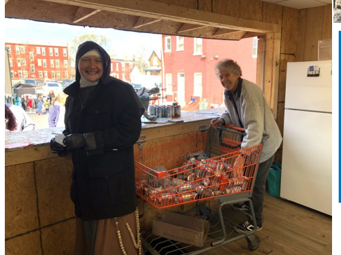
They are always there with love and a smile