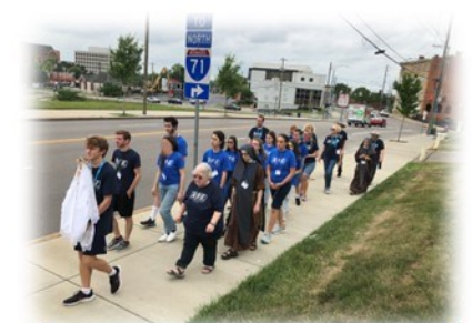
Students pray in front of Planned Parenthood